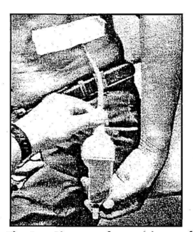
Fig 1: Size and position of device in relation to patient

The Pneumostat™ device is designed for pneumothorax with the added feature of a 30ml chamber to collect pleural fluid. The fluid can be removed repeatedly via the Leur port using a syringe without a needle. It has an internal mechanical one-way valve with a built-in vent.