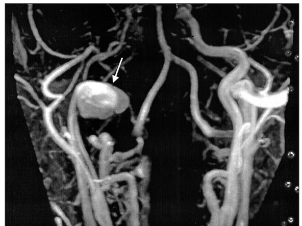
Fig. 2: MRA demonstrates the pseudoaneurysm of the right internal carotid artery (arrow)

Pseudoaneurysms may arise from any artery in the body. In the neck, the internal carotid artery is most commonly involved 1 . Pseudoaneurysms in the neck may be caused by trauma sustained during invasive procedures, penetrating neck injury or infection 1 . Pseudoaneurysms are also seen in intravenous drug abusers. Pseudoaneurysms and deep neck space infection cannot be differentiated clinically as both present with posterior pharyngeal swelling, drooling, neck lump, hoarse voice and stridor 1 . Diagnostic imaging procedures prior to any surgical intervention are essential. Computed tomography (CT) scan is the first line investigation in suspected deep neck infection. CT scan provides a good overall view of the neck and is non-invasive. It also detects early abscess formation and demonstrates the location and extent. The CT characteristics of pseudoaneurysm include loss of fat planes of the carotid artery and intense enhancement of the central portion of the mass located in the course of the carotid artery 2 . Vessel narrowing is a common feature and due either to spasm or inflammation of the vessel wall. The CT characteristics of retropharyngeal abscess include the presence of air interspersed in the