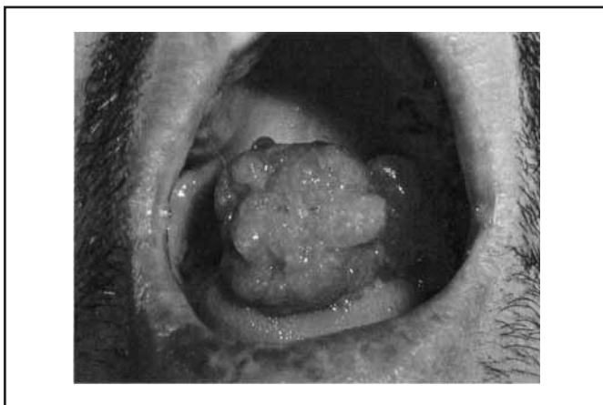
Fig. 1: Appearance of the growth in the patient's Oropharynx

The etiologic agent, Rhinosporidium seeberi , has never been successfully propagated in vitro. Initially thought to be a parasite for more than 50 years, R seeberi had been thought to be a water mold.