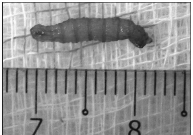
Fig. 2: An adult screwworm fly ( Chrysomya bezziana ).