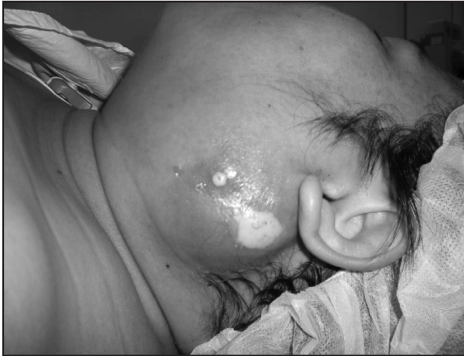
Fig. 1: Picture showing left parotid abscess.