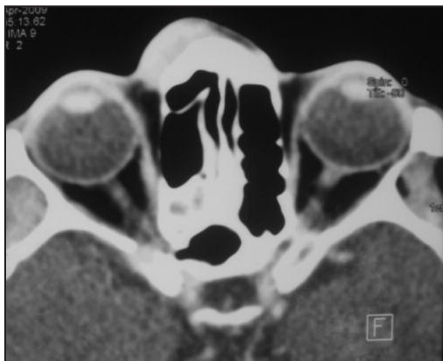
Fig. 1 : Computed tomography of paranasal sinuses showed a subcutaneous enhancing lesion over the right medial canthus without any bony erosion.