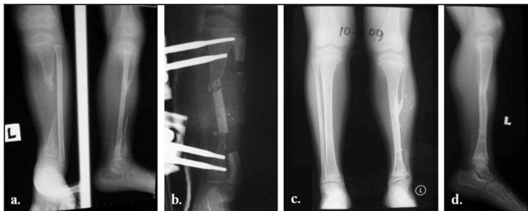
Fig. 4: Case 3: Anteroposterior and lateral (a) plain radiographs showed segmental bone loss at mid-shaft of the tibia, and after ipsilateral vascularised fibular graft with external fixation (b). The graft hypertrophied and corrected the length discrepancy and varus deformity of the leg (c and d).

Her clinical condition worsens despite intravenous antibiotic. Plain radiograph at one month of presentation showed evidence of pan-osteomyelitis of the tibia complicated with pathological fracture. Patient was put on full length cast and antibiotic was continued for another two months. However, subsequent plain radiograph showed an approximately 5cm bony resorption in the mid-shaft of the tibia (Fig. 4a). At this point of time, patient remained clinically aseptically. She started back to walk without any form of immobilization, causing varus deformity of the ankle. The affected leg was also short of about 3cm compared to the contralateral leg.