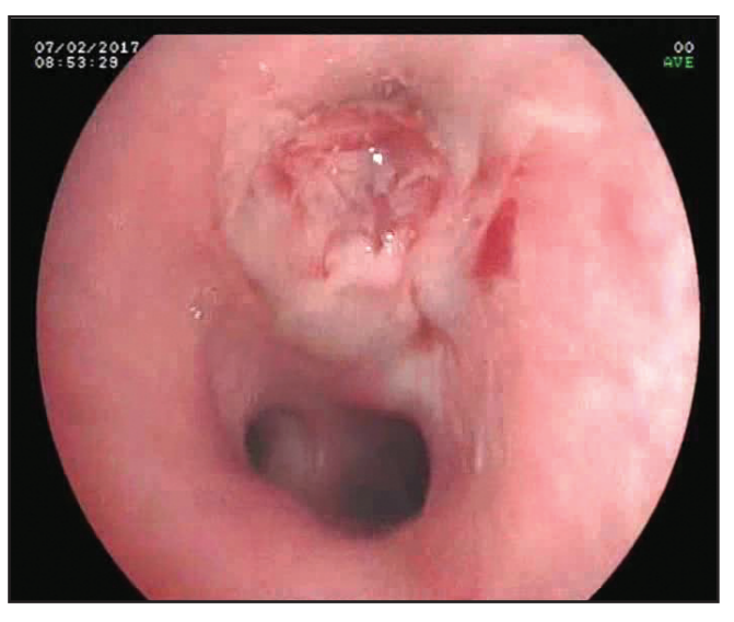
Fig. 2: Surveillance bronchoscopy six months post debulking demonstrated a patent LMB with occluded left upper lobe bronchus.

configuration of the inspiratory arm suggests unilateral obstruction of the main bronchi.<sup>1,4</sup> However, classical spirometric patterns for CAO are uncommon in daily practice as the pattern will depend on the site, extent and the type of obstructive lesion towards the maximum inspiratory and expiratory flow. Hence, the absence of classic spirometric patterns for CAO does not accurately predict the absence of pathology. Thus, endoscopic and radiological techniques are the next step to confirm CAO.5 Although the flow volume loop in our patient was normal, contrasted CT thorax demonstrated classical main bronchi obstruction with associated distal lung hyperinflation, which was confirmed endoscopically. This demonstrates the pertinent role of CT thorax and bronchoscopy in diagnosing central airway obstruction and the limitation of diagnosing central airway obstruction using flow volume loop clinically.