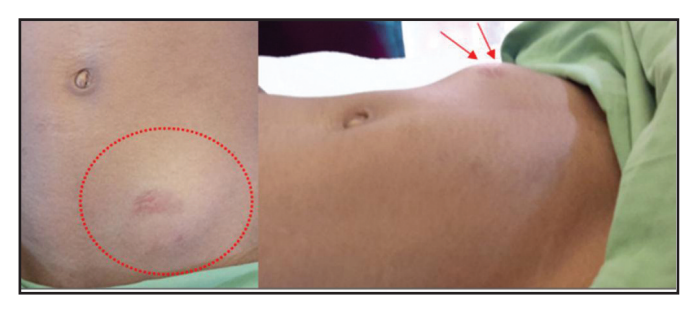
Fig. 1: Anterior view shows the abrasion and swelling on the left iliac fossa; lateral view shows the abdominal wall swelling.

abdominal injuries. However, CT scans are not easily available in Malaysian public hospitals. Hence, the decision for further imaging assessment should be based on careful history taking and thorough physical examination. If it is a high-impact injury with physical findings suggestive of concomitant injury, CT scan should always be performed. Our patient had presacral hematoma.