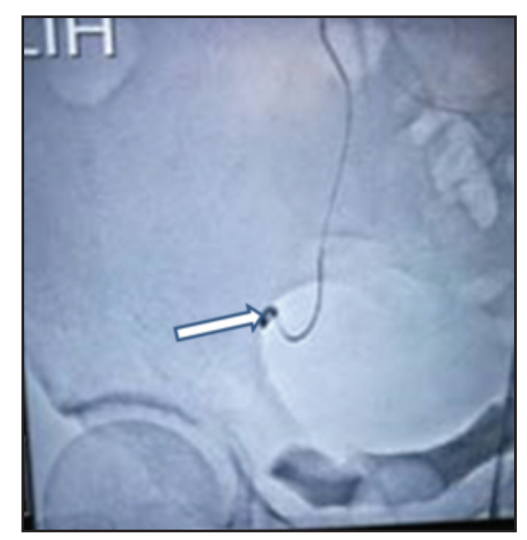
Fig. 2: Super-selective angiographic embolisation of the inferior branch of right uterine artery showing no further blood flow beyond the right cervical artery (arrow).

UAPs can be diagnosed with ultrasound, CT, or Magnetic Resonance Imaging, though angiography remains the gold