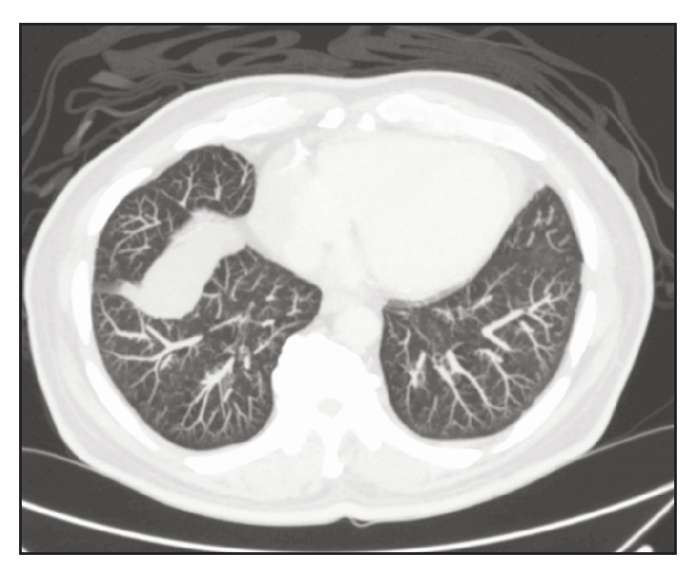
Fig. 2: CT-scan thorax shows there was a loculated fluid in the right transverse fissure.

diuretic therapy and the disappearance of the mass on repeated chest x-ray. Pseudotumour usually affects the right transverse fissure and present with lenticular shape, solitary right middle zone mass, but there were reported cases where multiple pseudotumours were present when there are other pulmonary fissures that are affected.<sup>2,3</sup> The pseudotumour can recur if the patient develops another episode of decompensated heart failure.<sup>1</sup> Our patient had systolic dysfunction associated with diabetic nephropathy and hypoalbuminemia. The proposed mechanism of this condition is due to atelectasis, pleuritis and adhesion.<sup>4</sup> Most of the time, there is no indication to proceed with further investigation, and serial chest x-ray is adequate especially if the patient has low clinical suspicion for other differential diagnoses.<sup>5</sup> However, in our patient, the right lung mass size