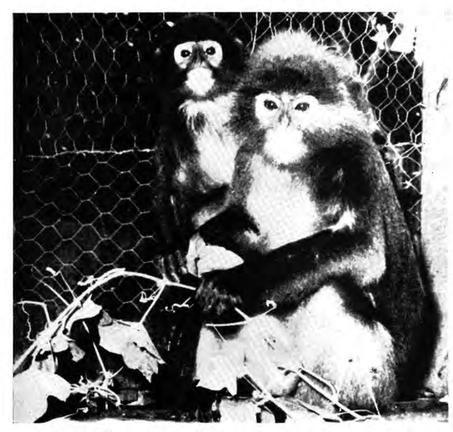
Fig. 5. Dusky leaf monkeys ( Presbytis obscurus ) which live in swamp forests and which are found naturally infected with the semi-periodic type of B.malayi .

Fig. 6. The water hyacynth (Eichornia crassipes) is one of the many aquatic plants to the roots of which the larvæ and pupæ of Mansonia spp. are commonly found attached.