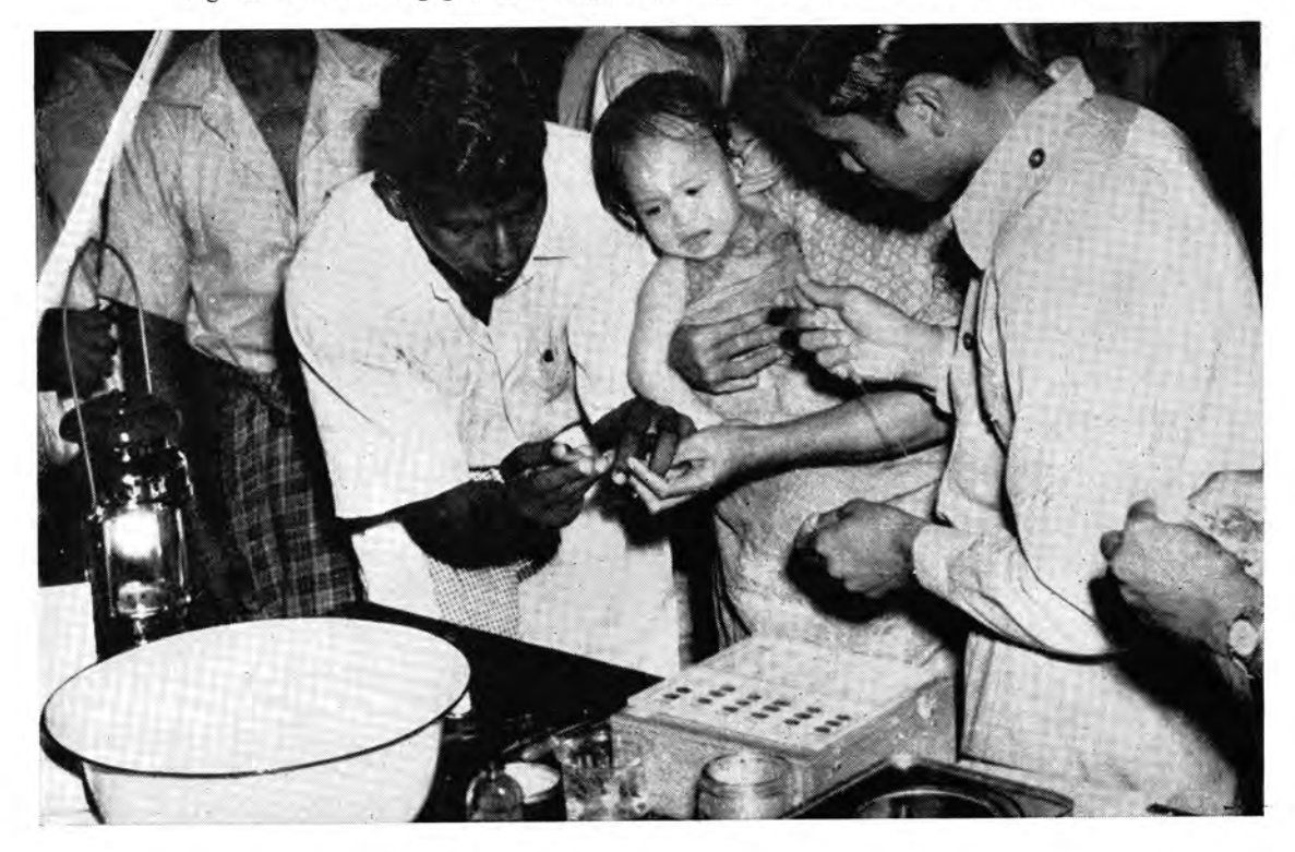
Fig. 9. A team engaged in taking blood films at night in a rural district.