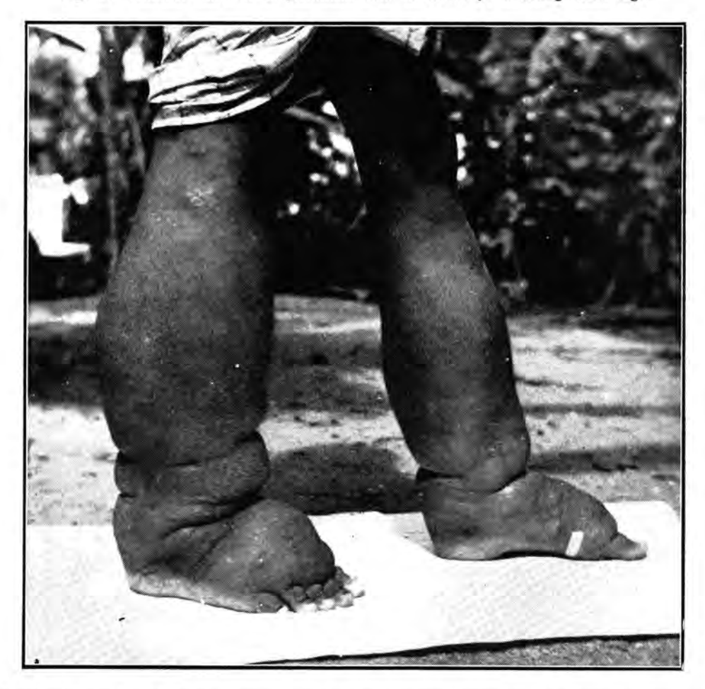
Fig. 8. Another case of elephantiasis due to B.malayi affecting both legs.

ber of microfilaria in all films upon the total number of films, both positive and negative).