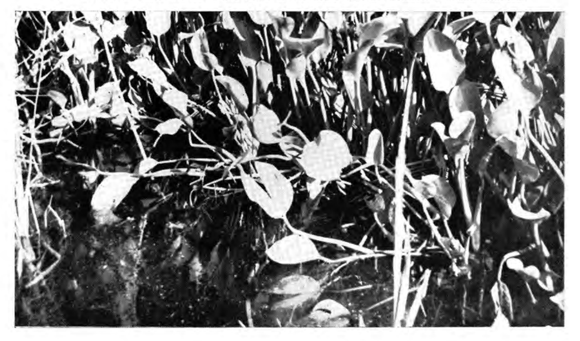
Fig. 6. The water hyacynth (Eichornia crassipes) is one of the many aquatic plants to the roots of which the larvæ and pupæ of Mansonia spp. are commonly found attached.

Fig. 5. Dusky leaf monkeys ( Presbytis obscurus ) which live in swamp forests and which are found naturally infected with the semi-periodic type of B.malayi .