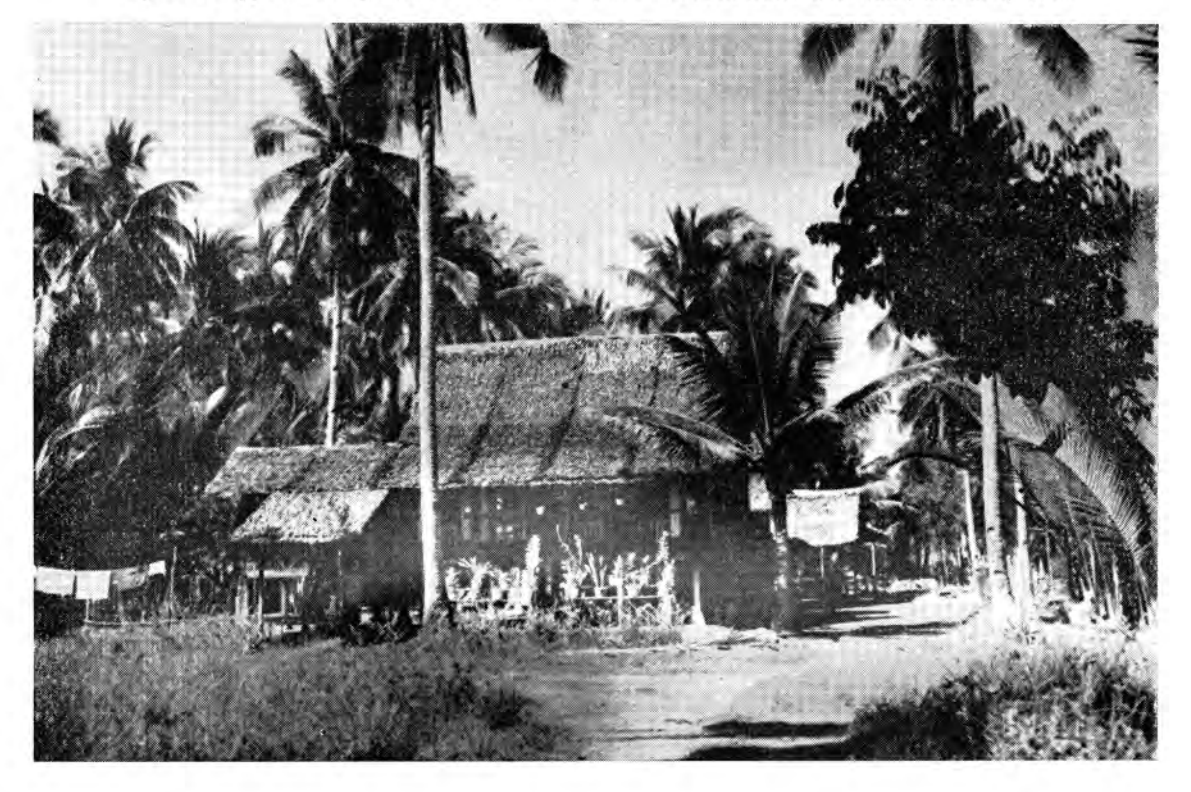
Fig. 3. A typical Malay house raised on stilts, with wooden floors and walls, and attap roof.

Fig. 2. Rice fields of the coastal plains in N.W. Malaya (a breeding place of Anopheles campestris) where the periodic type of B.malayi occurs.