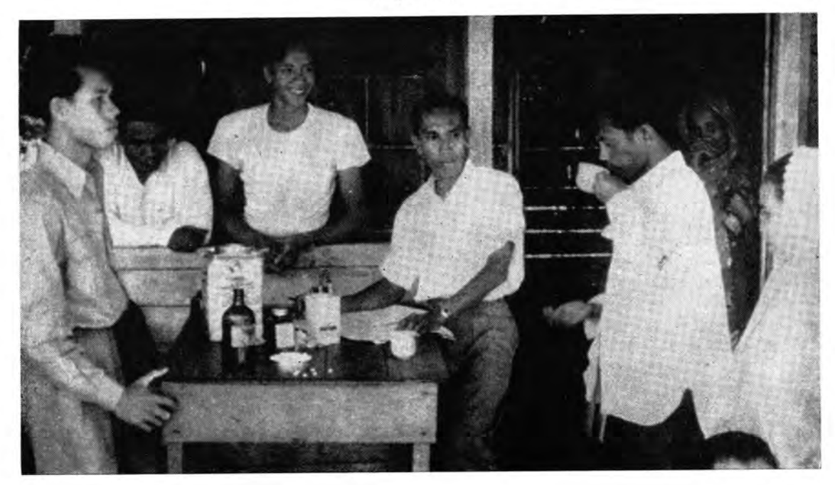
Fig. 10. A team giving mass treatment to people living in a rural area where filariasis is prevalent.

Fig. 9. A team engaged in taking blood films at night in a rural district.