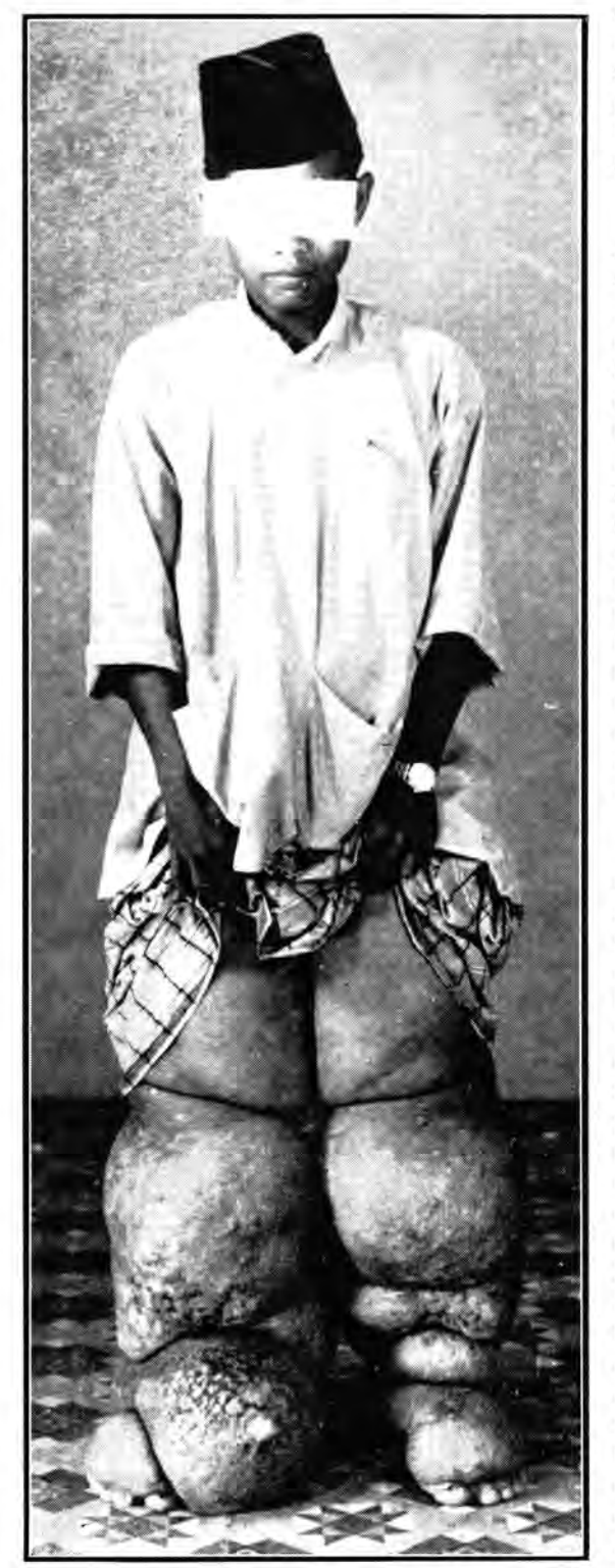
Fig. 7. A case of elephantiasis of both legs resulting from long-standing B.malayi infection.

to the less heavily infected areas at the same time carrying out resurveys in the areas covered by the first phase and retreating where necessary. It was expected that phase one should be completed by 1965 involving the use of 12 teams at an estimated cost for the five years (1961–1965) of M.$1,350,000 (U.S. $450,000).