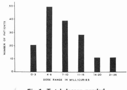
Fig 1: Total dosage needed

The majority of patients, 47, received an initial dose of from 4-6 millicuries and were controlled. There were no significant side effects. Most patients did not notice any changes during the first week. The earliest response was at the end of three weeks. There were quite a number who reported a sudden improvement at this time. Tenderness over the gland, cyctitis and parotitis were seen infrequently. Nearly all the cases had some improvement after the therapy. Many patients after the initial improvement relapsed.