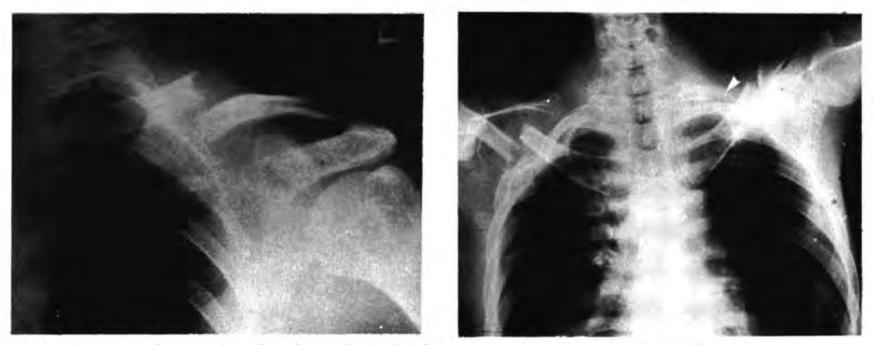
Fig. 1a, 2a, show the fracture of the first rib at their classical sites with associated fractures of the clavicle.