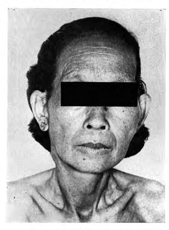
Fig. 6 Patient L. Note shrinkage of cervical nodes after Chemotherapy.