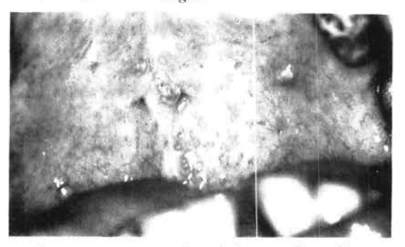
Shows regression of nodules on the palate, (Compare Fig 1).