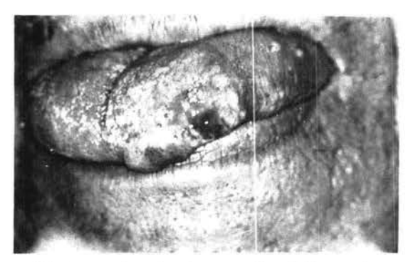
Shows a chronic ulcer on the left margin of tongue. Fig. 2

Since submission of this manuscript for publication two of our patients have had clinical signs of relapse. Although cultures of body fluids have been negative we have proceeded with re-treatment using minimal doses as indicated in this publication.