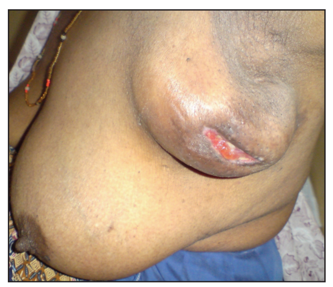
Fig. 1: Left axillary accessory breast carcinoma with central ulcer, post abscess drainage.