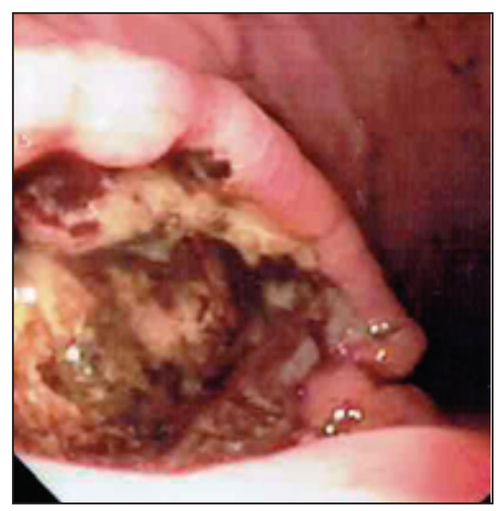
Fig. 1: Malignant looking ulcer with rolled up edges and fungating in nature at the incisura.