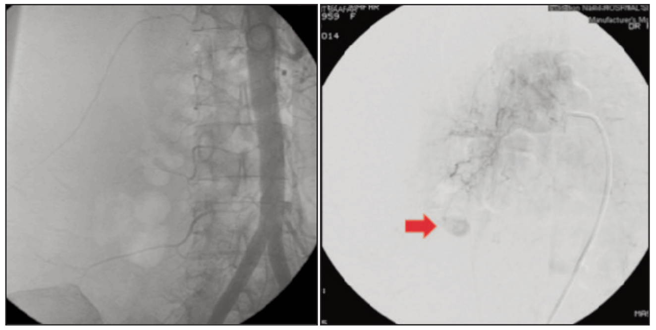
Fig. 2: Selective angiography of the second lumbar artery on the right side reveals an extravasation of contrast medium (red arrow).

malformation. Prompt computed tomography and angioembolization in this patient had prevented her from progressing into disseminated intravascular coagulopathy culminating in multi-organ failure which was commonly described in dengue patients with massive bleeding. To date, the role of angiography and selective angioembolization in managing severe dengue bleed have not been explored. This could provide a valuable alternative to conservative management with blood products transfusion especially in fast deteriorating case. Our case illustrated that angioembolization may play an important role in managing patient with major bleeding involving arterial bleed.