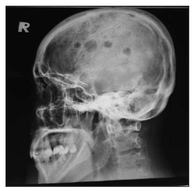
Fig. 2: Skull X-ray shows multiple lytic lesions, which are characteristics of multiple myeloma.

Multiple myeloma is a haematological malignancy where there is abnormal proliferation of plasma cells. The plasma cells proliferate in the bone marrow resulting in skeleton destruction and pathological fractures.<sup>5</sup> It is a disease of older adults, with a median age at diagnosis of 66 years. Only 10% of patients were younger than 50 years old. The common presenting symptoms were anaemia (73%), bone pain (58%), elevated creatinine (48%), hypercalcaemia (28%), and weight loss (24%).5 Ophthalmological manifestations are rare in multiple myeloma. Diagnosis is by the presence of monoclonal protein in serum, clonal plasma cells of >10% in the bone marrow, and evidence of end organ damage due to plasma cell dyscrasia (lytic bone lesions, anaemia, and renal impairment). The treatment of multiple myeloma includes chemotherapy drugs (e.g., melphalan, cyclophosphamide, thalidomide, and bortezomib), doxorubicin, corticosteroids.