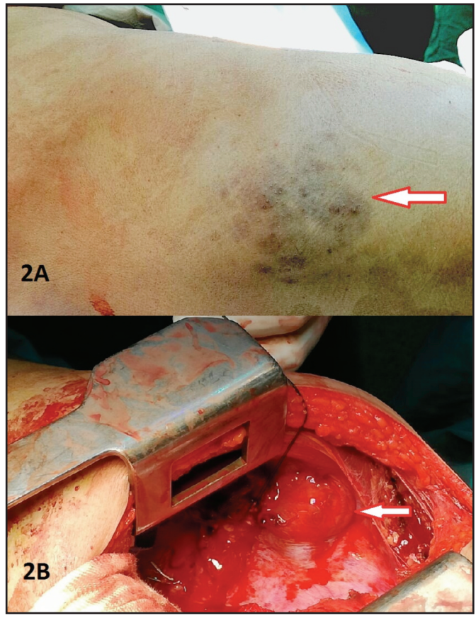
Fig. 2: A) shows the hyperpigmentation of the right side of posterior chest wall with café-au lait patches.B) is the intra-operative photograph of the ruptured