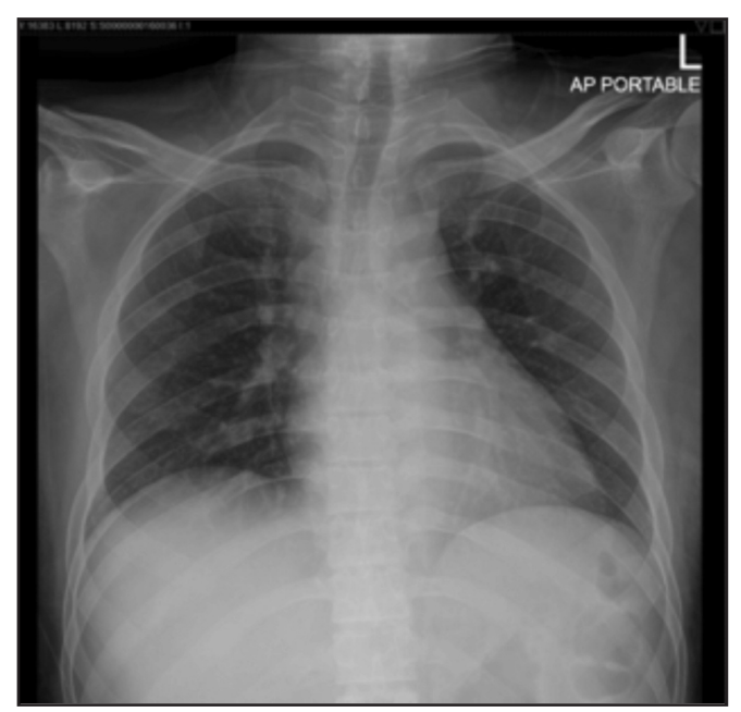
Fig. 2: Chest radiograph during admission did not reveal any abnormalities.

Further investigations showed hypocomplementemia with a high titre of anti-dsDNA suggestive of a lupus flare. The initial urine protein creatinine index (PCI) result was 0.14 g/mmol creatinine, but it rose to nephrotic range later. His chest radiograph at admission was normal (Figure 2) but the computed tomography scan of the chest revealed ground glass opacities at the periphery of the lower zone of the right lung (Figure 3). Additionally, there was no intra-articular collection or deep-seated abscess found on ultrasound at the region of the elbow. Skin biopsy results confirmed the presence of abscess without evidence of vasculitis. The skin biopsy culture and the blood culture were both negative.