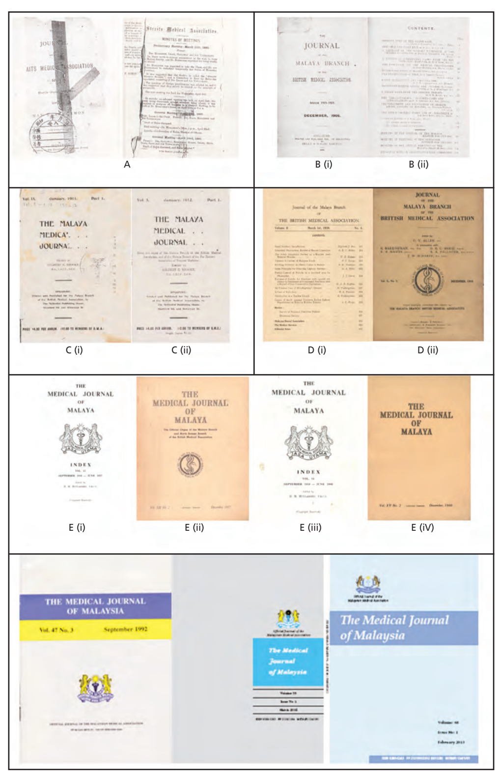
Fig. 1: A:First edition of the Journal of Straits Medical Association March–September 1890; B(i): The front page of the Journal of the Malaya Branch of the BMA session 1904–1905; B(ii): The contents of the Volume 3: Session 1905–1906 of the Journal of the Malaya Branch of the BMA; C (i): The front page of the Malaya Medical Journal, January 1911, Vol IX. Part 1; C (ii): The front page of the Malaya Medical Journal, January 1912, Vol X. Part 1; D (i): The content page of the Journal of the Malaya Branch of the British Medical Association, Volume II, No. 4 (1st March 1939); D(ii): Front page of the Journal of the Malaya Branch of the British Medical Association, Volume 3, No. 3 (December 1939); E(i): Index page of the Medical Journal of Malaya, Volume 11, September 1956–June 1957; E(iii): Front page of the Medical Journal of Malaya, Volume 12, No. 2 December 1957; E(iii): Index page of the Medical Journal of Malaya, Volume 15, No.2 December 1960; F(i) Front page of the Medical Journal of Malaysia, Volume 47, Issue 3 September 1992; F(ii) Front page of the Medical Journal of Malaysia, Volume 64, Issue 1 March 2009