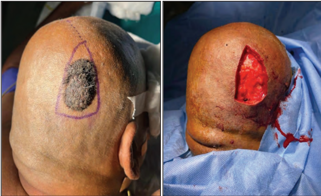
Fig. 1: Intra operative before excision and post excision