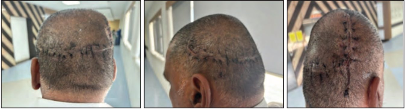
Fig. 3: Post operative scar quality