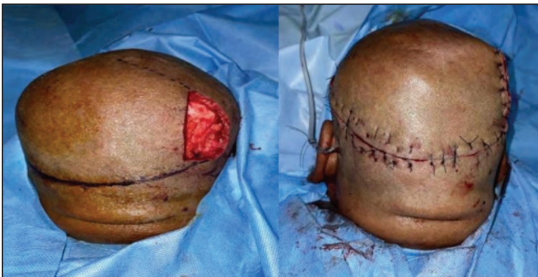
Fig. 2: Intra operative rotational flap cover

However, the exact pathogenesis of seborrheic keratosis remains incompletely understood. However, emerging evidence suggests a genetic predisposition, with mutations in the fibroblast growth factor receptor-3 (FGFR3) and PIK3CA oncogenes implicated in its development. Specifically, activating mutations in FGFR3 are common in sporadic cases of seborrheic keratosis, driving the proliferation of keratinocytes and contributing to tumor growth. Moreover, various subtypes of seborrheic keratosis exist, each exhibiting distinct histopathological features including hyperkeratosis, acanthosis, pseudocysts, hyperpigmentation, inflammation, and dyskeratosis.