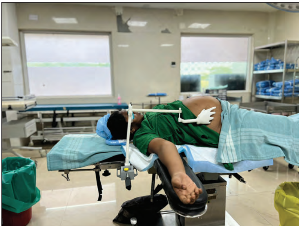
Fig. 3: 3D printed modified uterine displacement device on patient