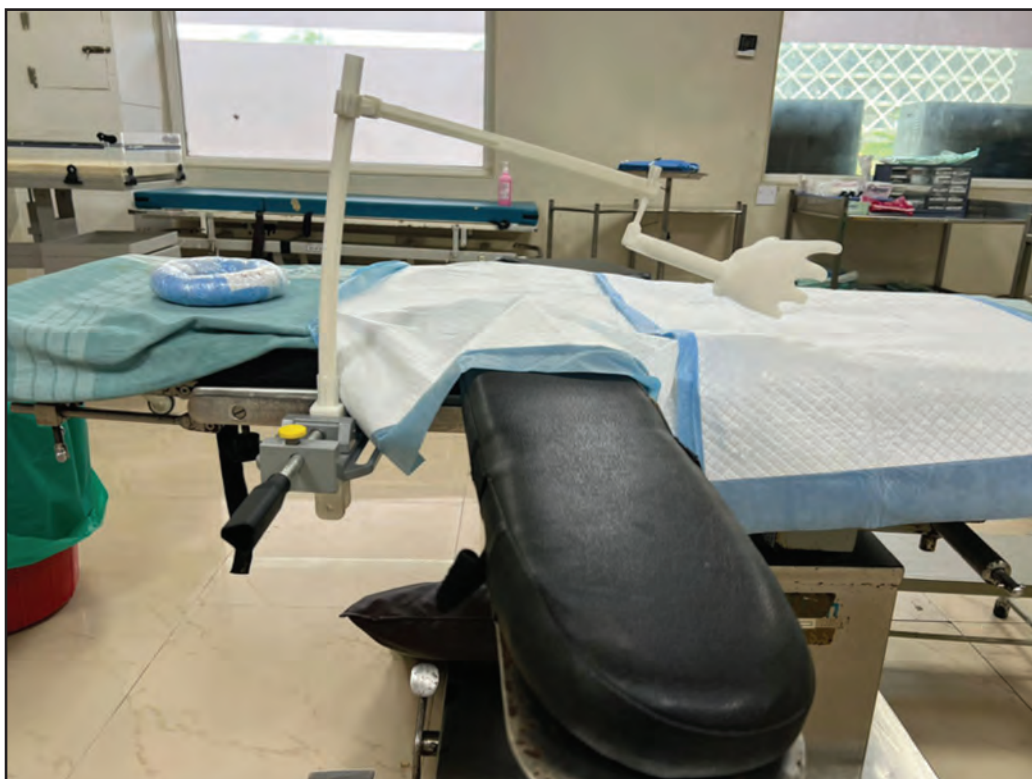
Fig. 2: 3D printed modified uterine displacement device